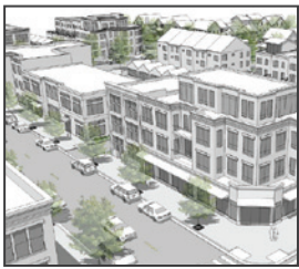
ILLUSTRATION OF ZONING DISTRICTS. A drawing and intent statement that defines and illustrates the main characteristics of each district.

PLACE-SPECIFIC MAP. A fine-grained zoning map - detailed to the level of individual lots, blocks and streets - a level of detail not found in a conventional zoning code.